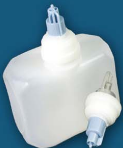
Proprietary Foam & Lotion Cartridge