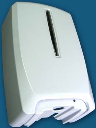
Touch Free Dispenser

A complete and comprehensive Hand Hygiene System that dispenses foam, liquid, soaps & sanitizers while accommodating a universal base & cover for easy field upgradeability from manual to touch-free.